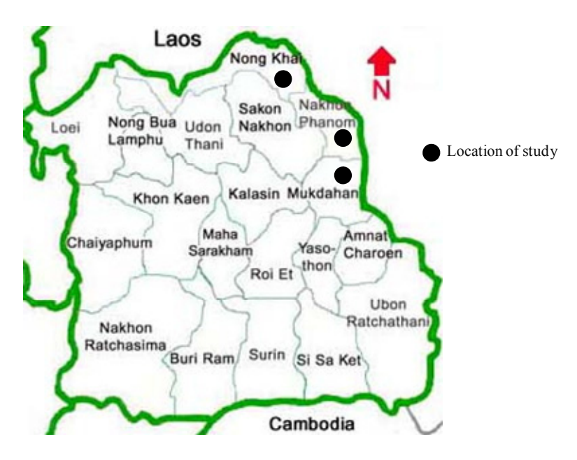
Figure 2. Location of study (http://www.trekthailand.net/p2/map.jpg)